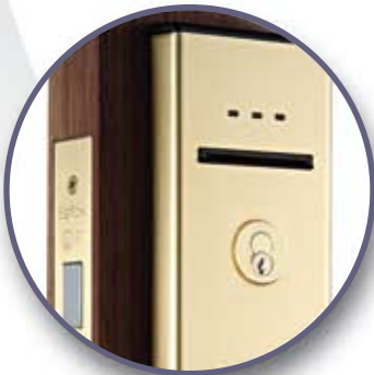
SAFLOK MT with Mechanical Key Override (MKO) ®