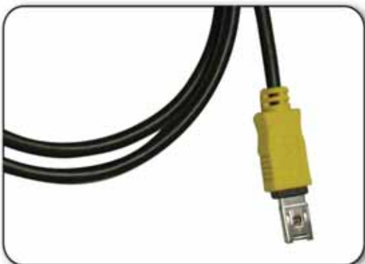
72110 RFID Reader Voltmeter Kit